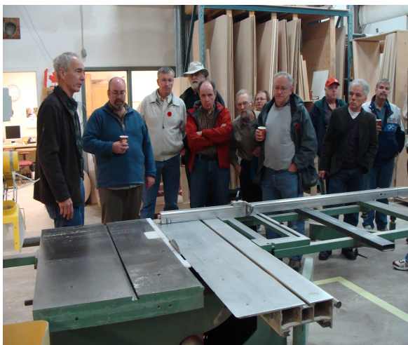
Illustration 2: Lake City Woodworkers Tour