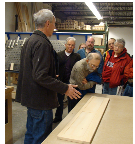
Illustration 1: Lake City Woodworkers